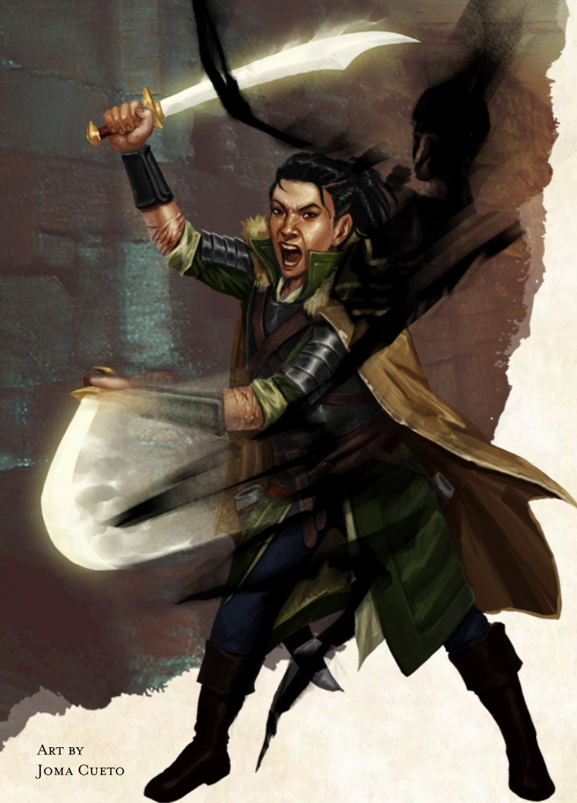
ART BY JOMA CUETO

take 4d6 psychic damage and must make a Wisdom saving throw. On a failure, the teleport or plane shift fails.